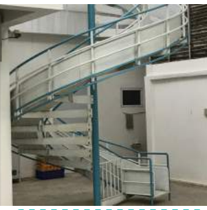
Annual dental & physical examinations by designated doctors to all Students to check status of child's overall health & development, and results will be reported to parents.

Live web-cam images are accessible via Internet by registered parents to see how their children are doing at CPIPS through a simple App installation on their phone.