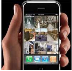
Japanese standards of safety & security: Double-door security entrance, children's emergency slide, safety gaps in doors to avoid finger accidents, high door handles & more.